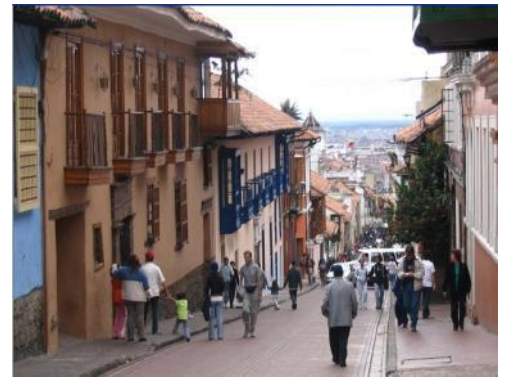
Street scene in Bogotá, Colombia

Dominus, S. (2015, July 12). The Mixed-Up Brothers of Bogotá. The New York Times Magazine . Retrieved from https://www.nytimes.com/2015/07/12/magazine/the-mixed-up-brothers-of-bogota.html